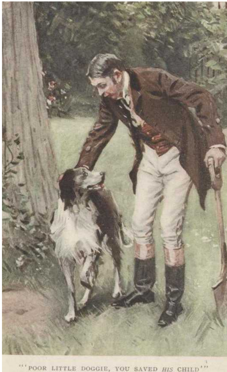
“POOR LITTLE DOGGIE, YOU SAVED HIS CHILD.”

I have watched two whole weeks, and he doesn't come up! This last week a fright has been stealing upon me. I think there is something terrible about this. I do not know what it is, but the fear makes me sick, and I cannot eat, though the servants bring me the best of food; and they pet me so, and even come in the night, and cry, and say, “Poor doggie—do give it up and come home; don't break our hearts!” and all this terrifies me the more, and makes me sure something has happened. And I am so weak; since yesterday I cannot stand on my feet anymore. And within this hour the servants, looking toward the sun where it was sinking out of sight and the night chill coming on, said things I could not understand, but they carried something cold to my heart.